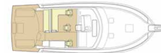
HELM DECK ARRANGEMENT (OPTIONAL)