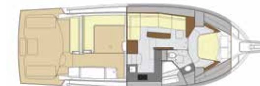
MAIN CABIN STANDARD ARRANGEMENT