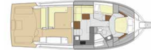
MAIN CABIN W/ TWO STATEROOMS (OPTIONAL)